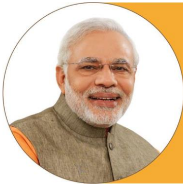
Shri Narendra Modi